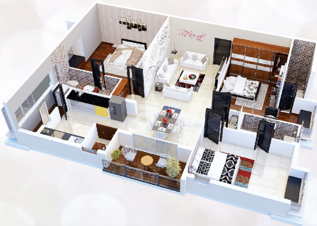
WEST FACING FLAT 1940 SFT