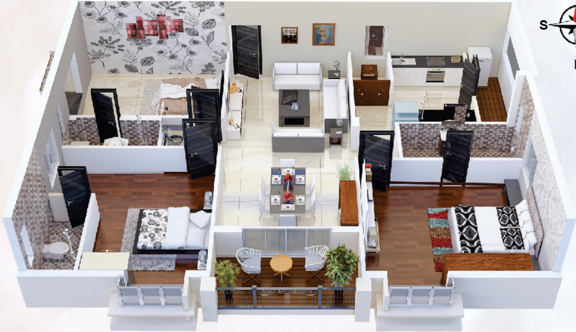
EAST FACING FLAT 1940 SFT